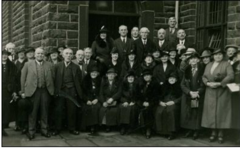
Church Members 1925

Heald Wesleyan Church closed in 1985 in 1932 it was gutted by fire which destroyed most of the church sanctuary organ and pulpit. The church was rebuilt and back open for services by 1933.